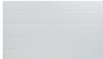
RIBBED PANEL WITH STUCCO EMBOSMENT