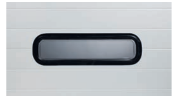
20" X 5" ACRYLIC BUBBLE WINDOWS