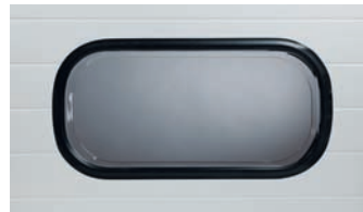
25" X 12" ACRYLIC BUBBLE WINDOWS