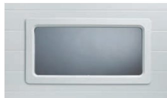
24" X 12" INSULATED GLASS